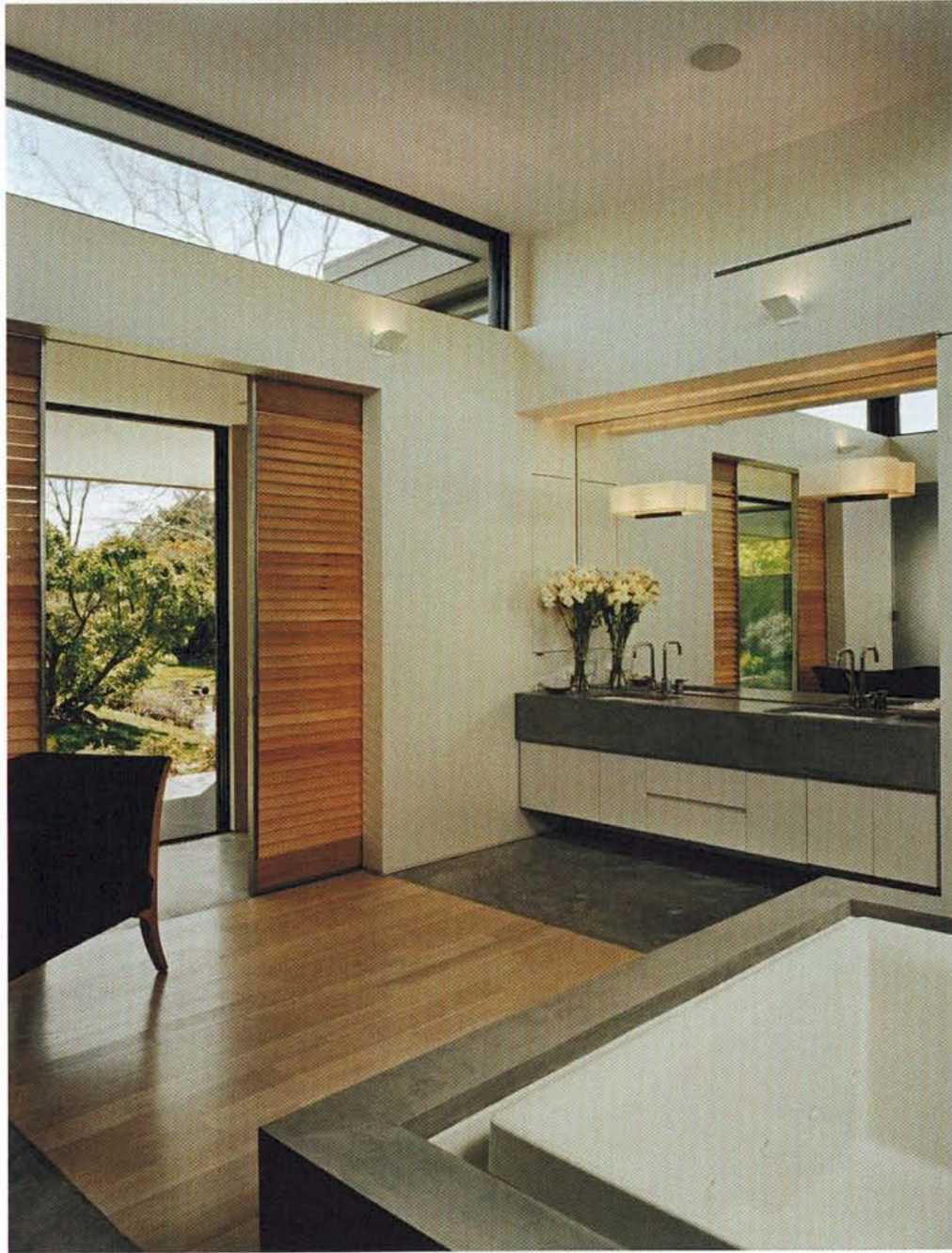
ABOVE: The master bath is like a private cabana opening onto the garden.