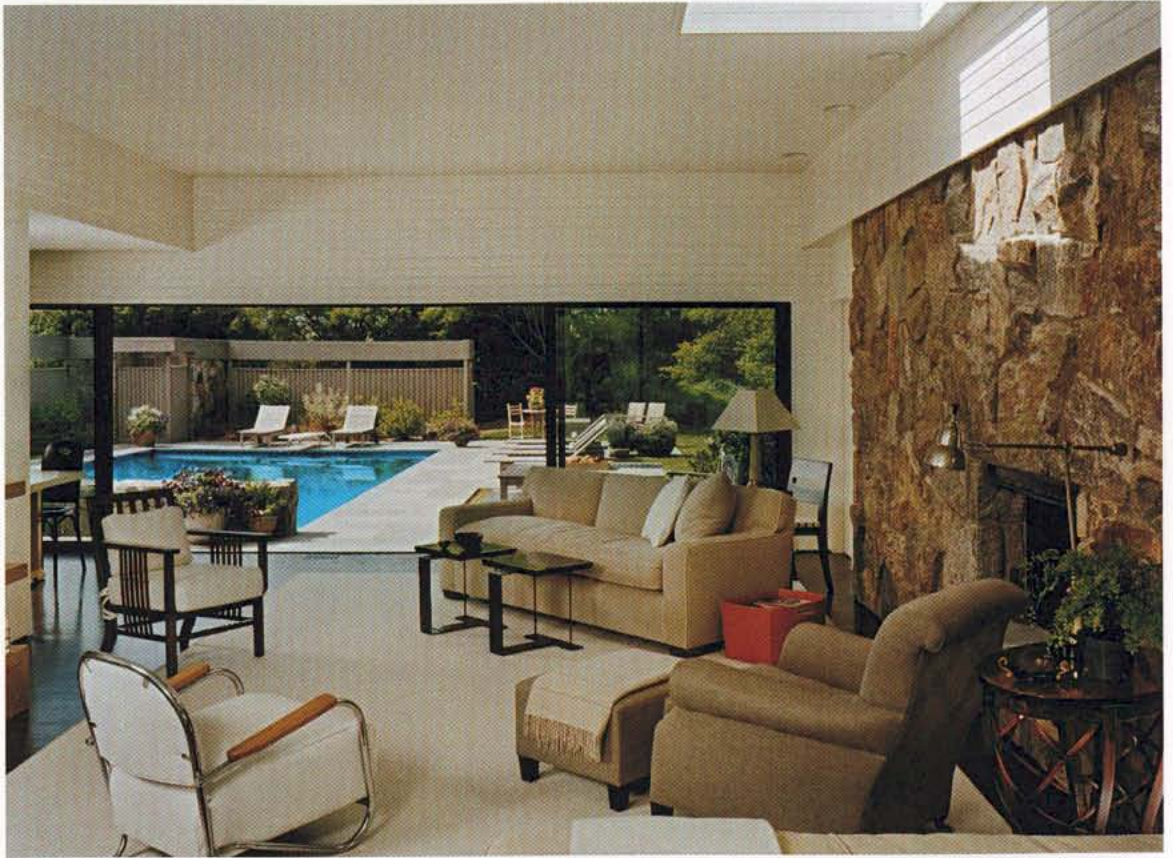
TOP RIGHT: Living room and pool-scape merge on a sunny morning. (Interiors by Tori Golub)