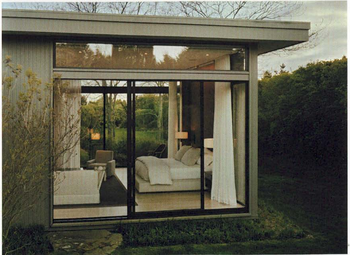
BOTTOM RIGHT: The master bedroom sits in a landscape which seems to flow through it.