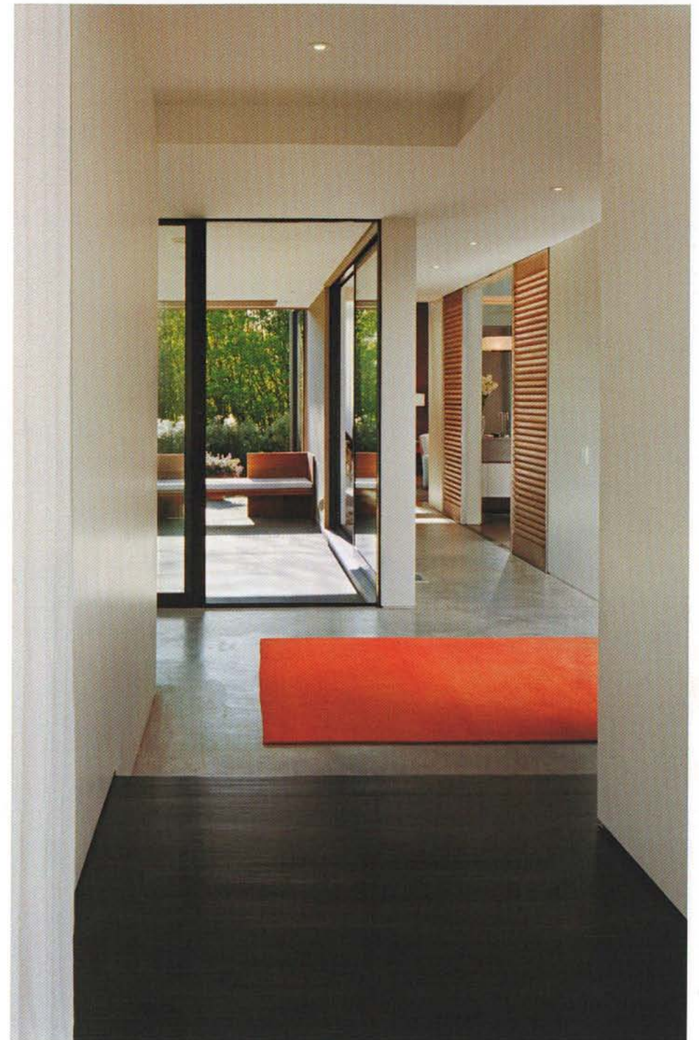
ABOVE: Planes of glass, concrete, ebonized white oak and daylight wrap the views in this corridor.

His design philosophy — deliberate use of materials, structures that resonate with their settings, and a contemplative approach to every detail — bears the influence not only of his studies at Yale and Harvard and his time at New York City and East End architecture firms, but also of internships with environmental sculptors James Turrell and Eric Orr and in theater set design and construction at the Julliard School. Today, he spends most of his time working on projects in the Hamptons, striving to create houses that are true expressions of the people who live in them and that remain reflective of their historic landscapes.